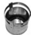
Flex Pellet Tee Cap