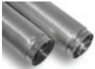
Co-Axial Flex Extensions

Designed to perform in the most adverse weather conditions be it wind, rain or snow.