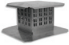
Pro-Form Insert Co-Linear DV Termination Cap