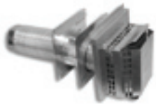
Horizontal Co-Axial DV Term Kit

Engineered to withstand the most adverse weather, the Pro-Form® Direct Vent Cap outperforms so your home remains warm.